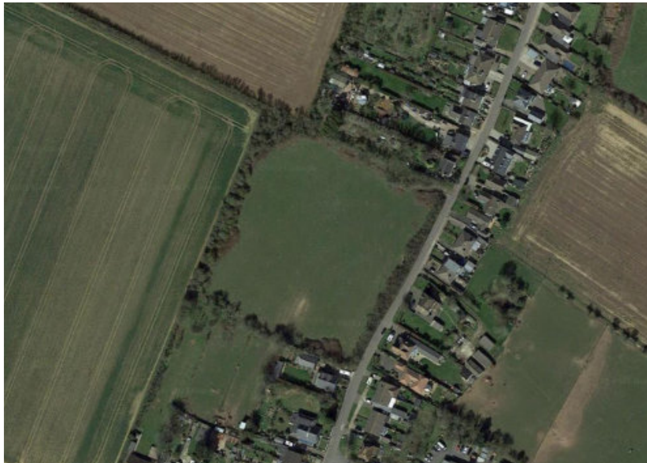
Aerial photograph take from Google Maps