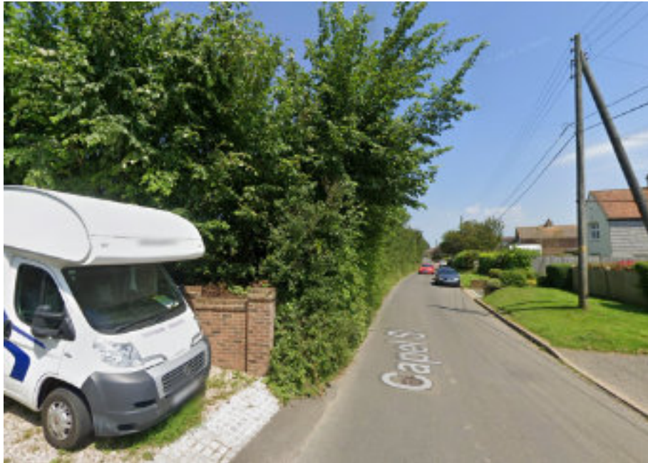
IMAGE A - FACING NORTH TOWARDS SOUTHERN CORNER OF THE SITE