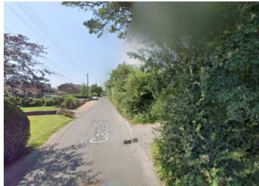
IMAGE D - FACING SOUTH ALONG SITE BOUNDARY