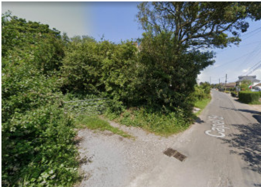
IMAGE C - FACING NORTH SHOWING EXISTING ACCESS TO SITE