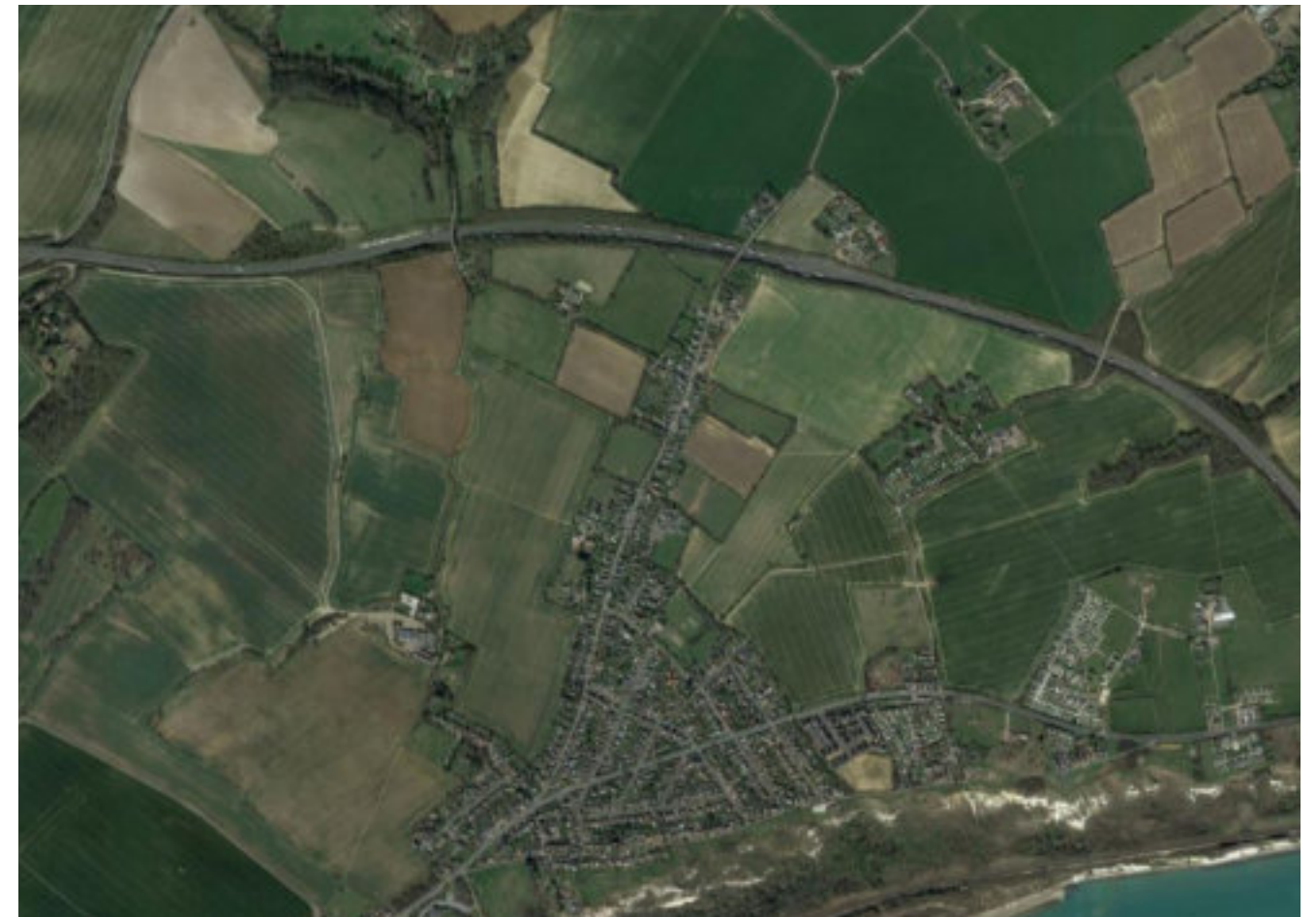
Aerial photo