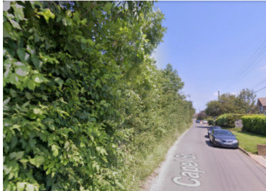
IMAGE B - FACING NORTH SHOWING EXISTING HEDGEROW TO SITE BOUNDARY