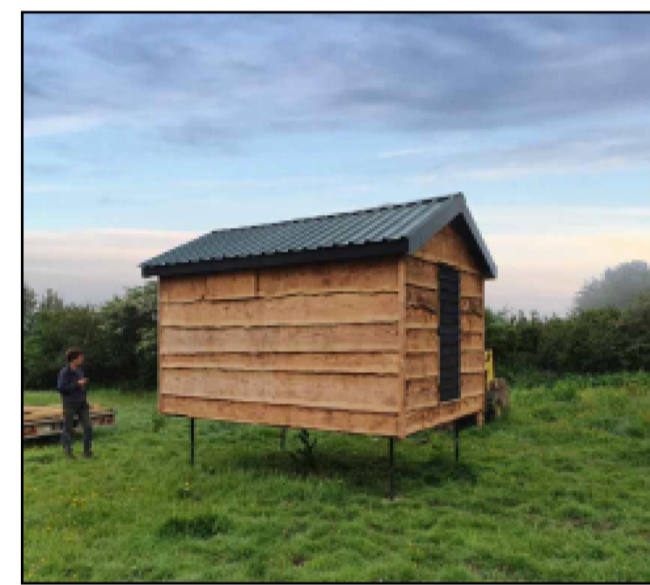
Example of Bat Roost from 'batroost.co.uk'

Notes: Do not scale except for planning purposes only. Report all discrepancies, errors and omissions. Verify all dimensions on site before commencing any work on site or preparing shop drawings. All materials, components and workmanship are to comply with the relevant British Standards, Codes of Practice, and applicable manufacturers recommendations that from time to time shall apply. For all specialist work, see relevant specialist manufacturers drawings. This drawing and design are copyright of Andrew Wells Architectural Planning & Design Ltd.