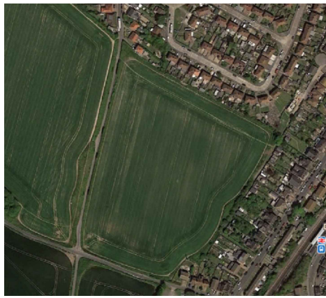
NORTH SOUTH AERIAL VIEW