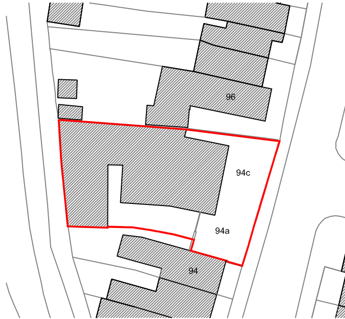
EXISTING - BLOCK PLAN [1:500@A4]