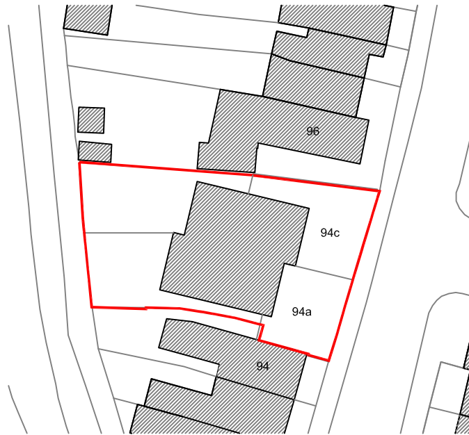
PROPOSED - BLOCK PLAN [1:500@A4]