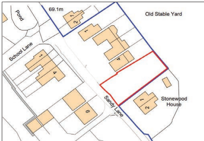
Block Plan of the Development