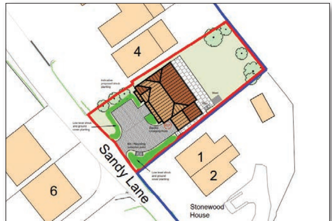
Location Plan of Detached New Build