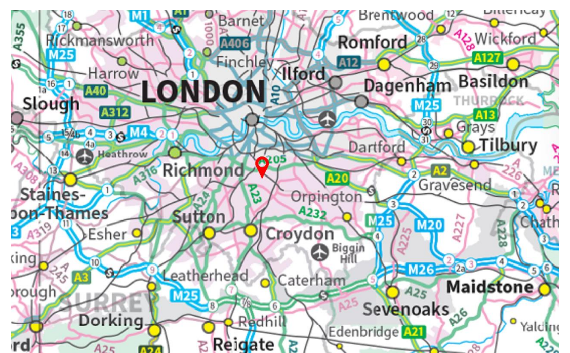
All photographs, graphics and plans are for illustrative purposes only and all measurements are approximate