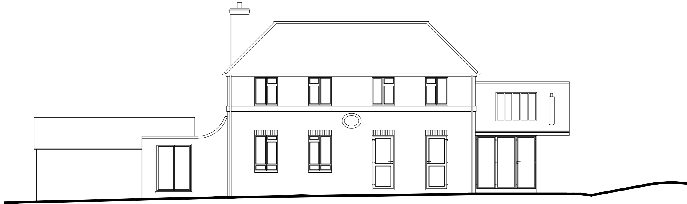
East Elevation as Existing 1:100