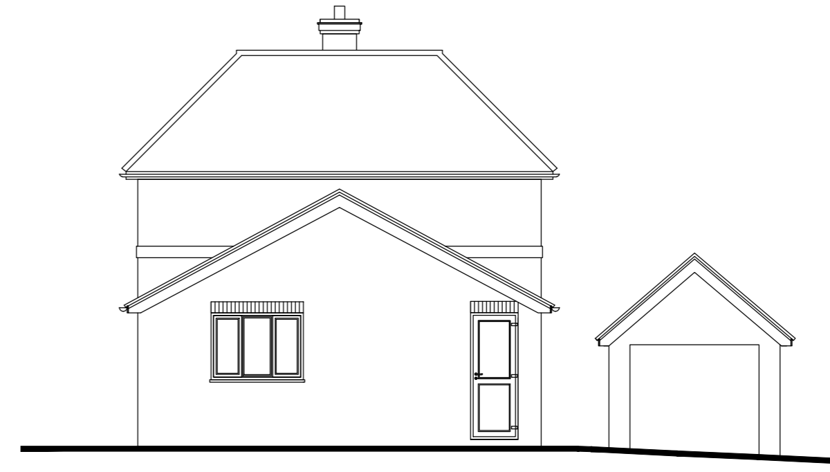
North Elevation as Existing 1:100