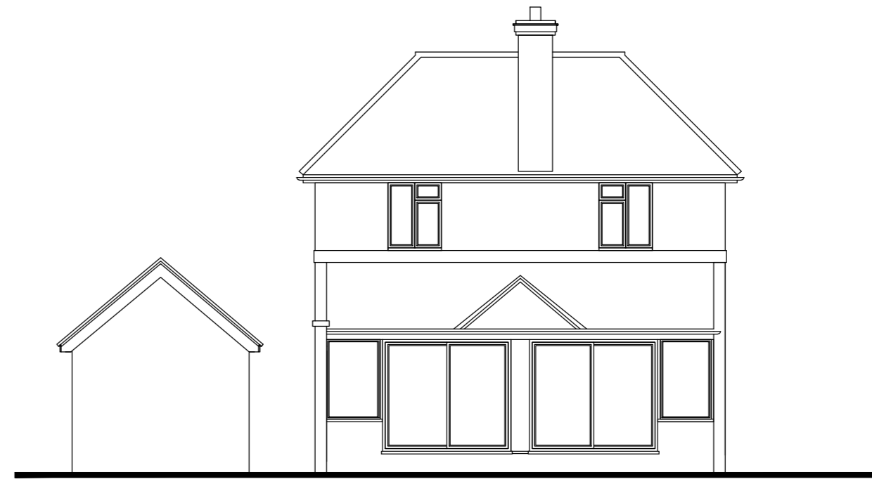
South Elevation as Existing 1:100