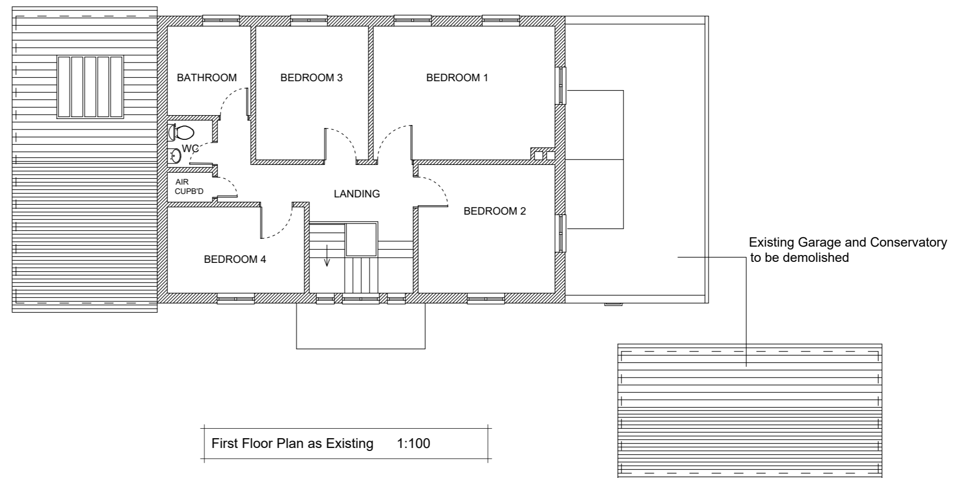
First Floor Plan as Existing 1:100