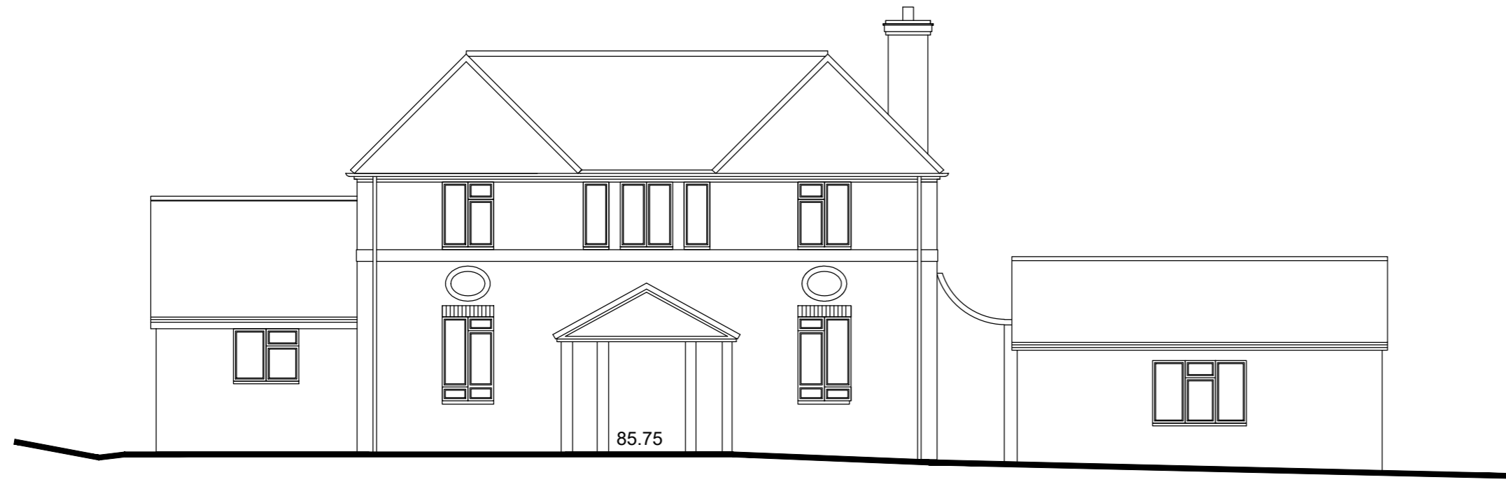
West Elevation as Existing 1:100