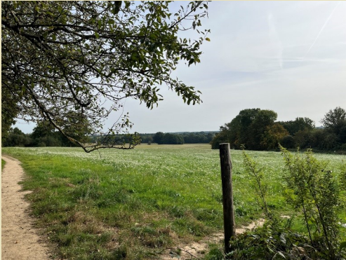
Field Beyond Rear Boundary