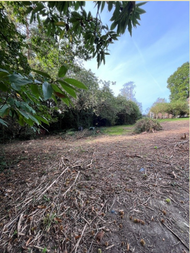
Rear Garden (Site)