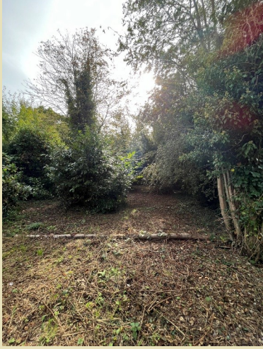
Rear Garden (Site)