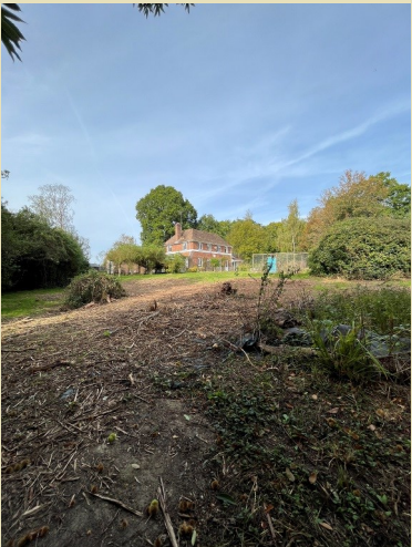
Rear Garden (Site)