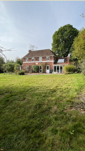
Existing House (Rear)