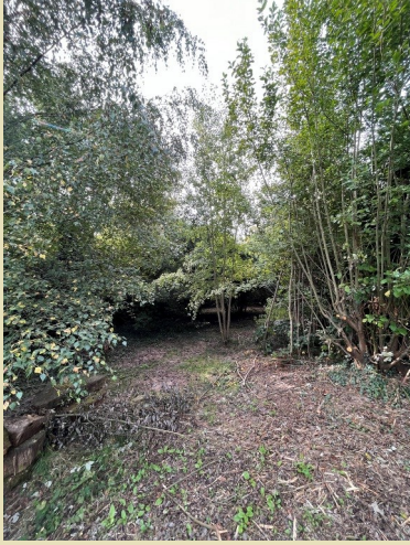
Rear Garden (Site)