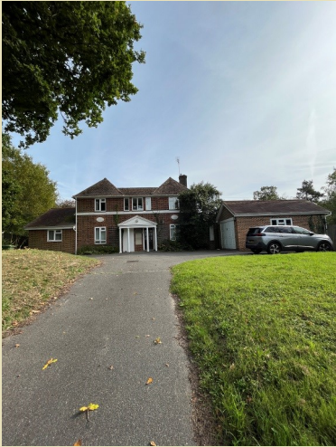
Existing House (Front)