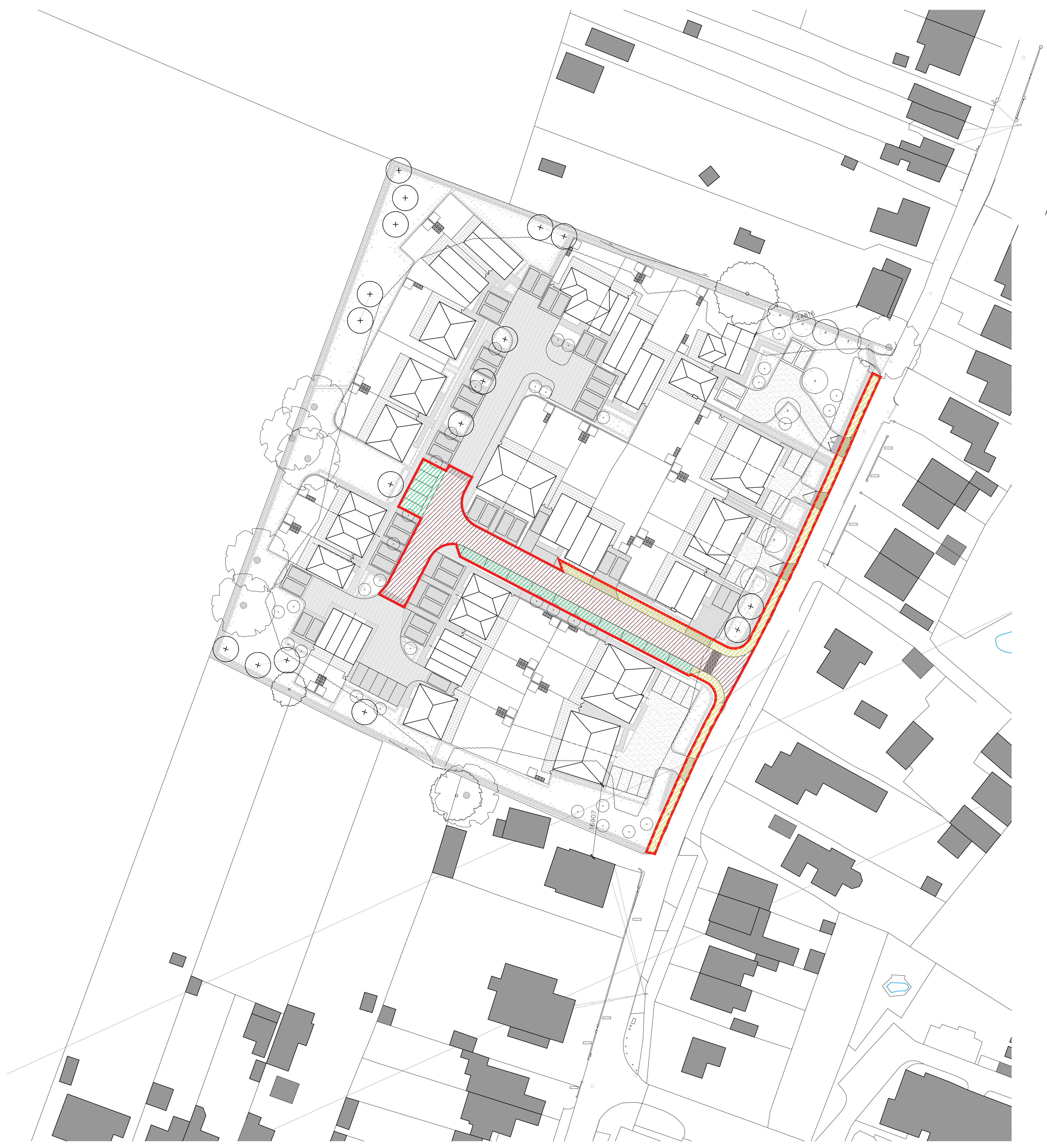
HIGHWAYS ADOPTION PLAN