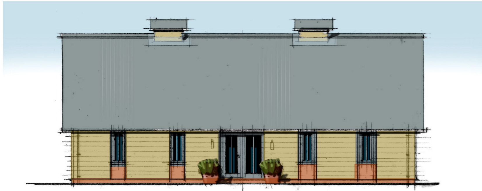
proposed front elevation 1:100