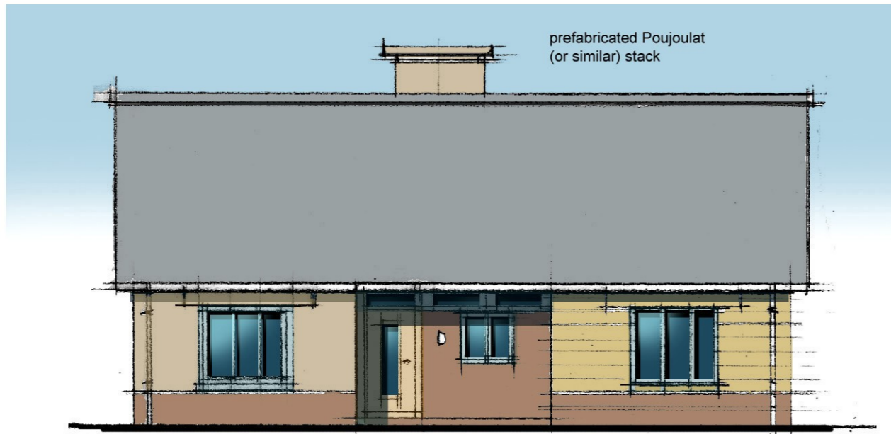
proposed front elevation 1:100