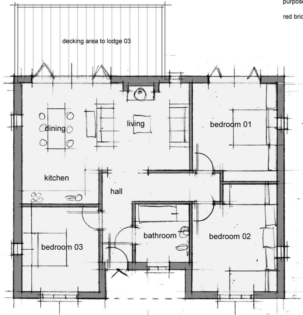
proposed floor plan 1:100