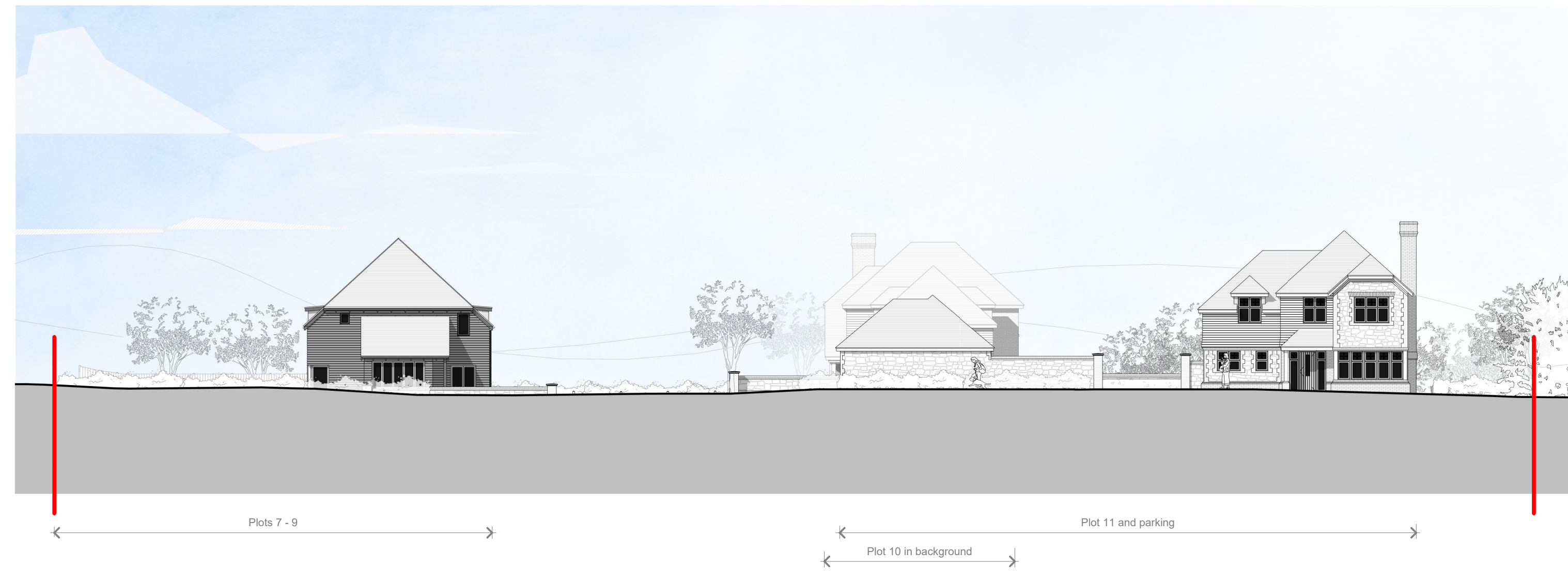
Proposed Section A-A Scale 1 : 200