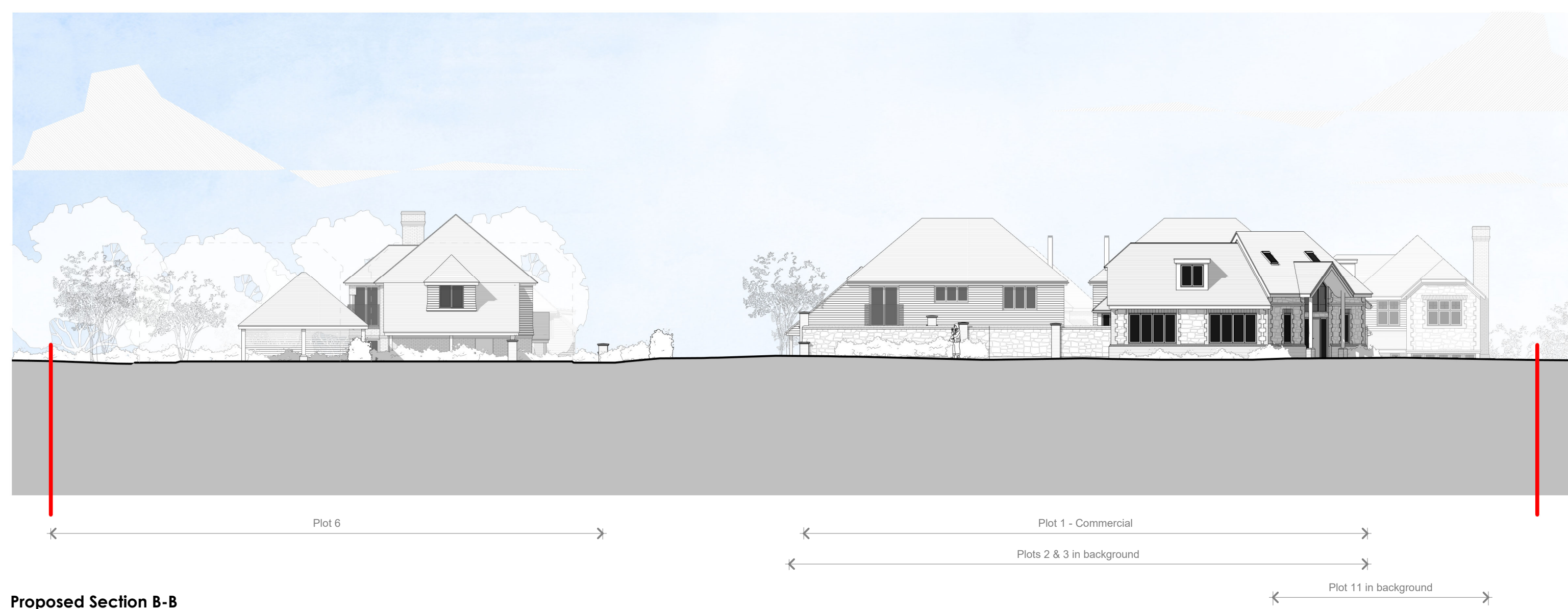
Proposed Section B-B Scale 1 : 200