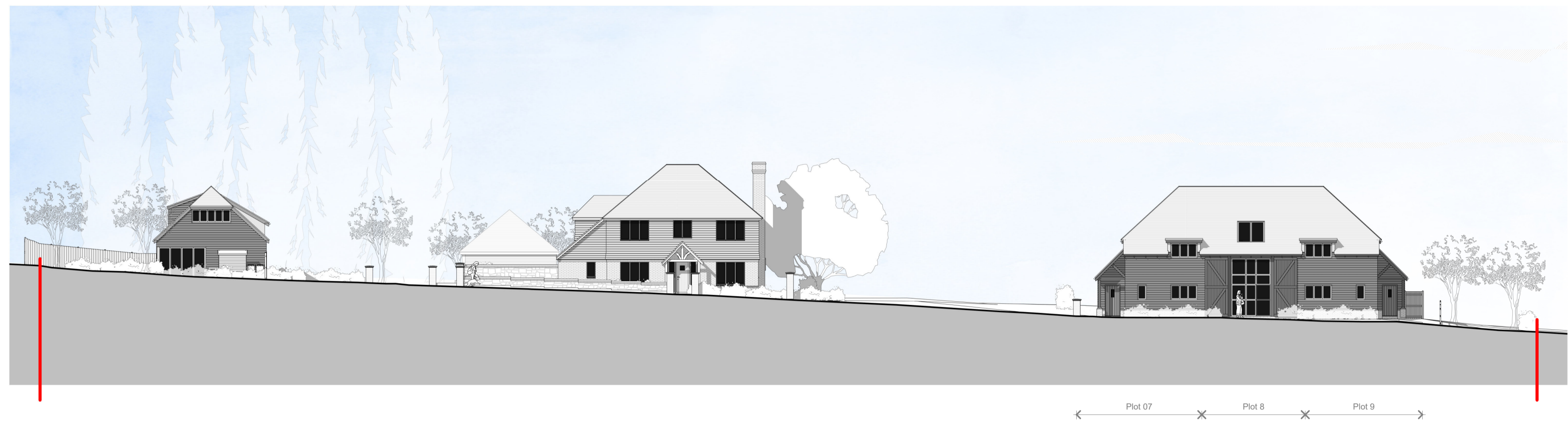
Proposed Section C-C Scale 1:200

Notes: DoNot Scale. Use only figured dimensions. all dimensions to be checked on site prior to construction. Any discrepancies to be notified to the architects. All Copyright Reserved to Offset Architects.