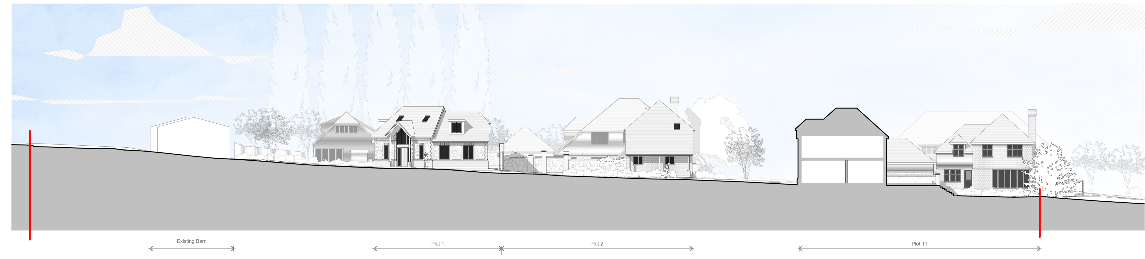
Proposed Section D-D Scale 1:200