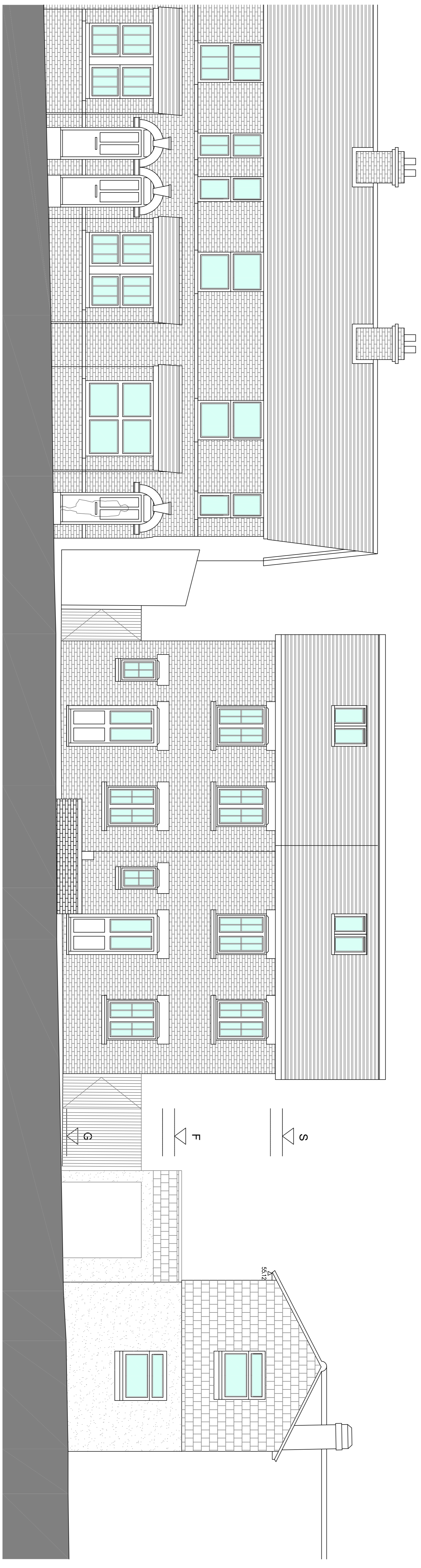
PROPOSED PRIMARY ELEVATION 1:50@A1