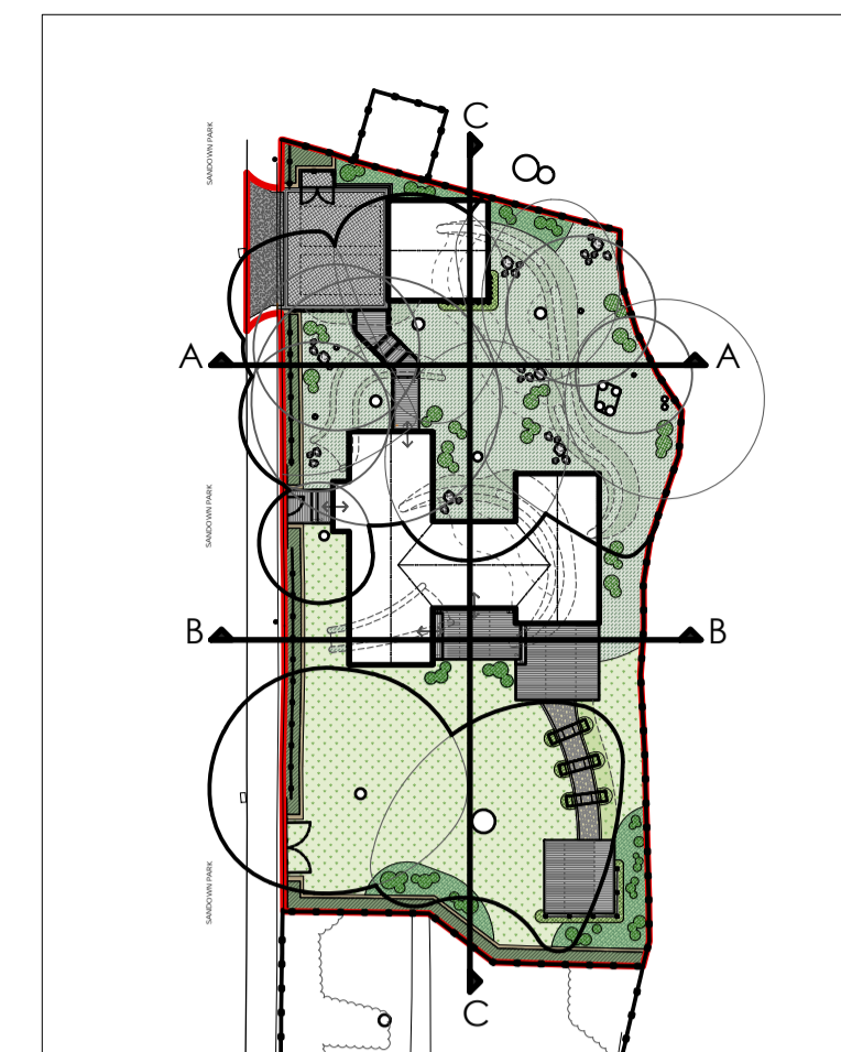
Location Plan not to scale