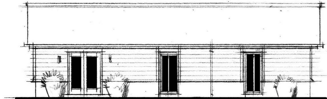
proposed rear elevation 1:100