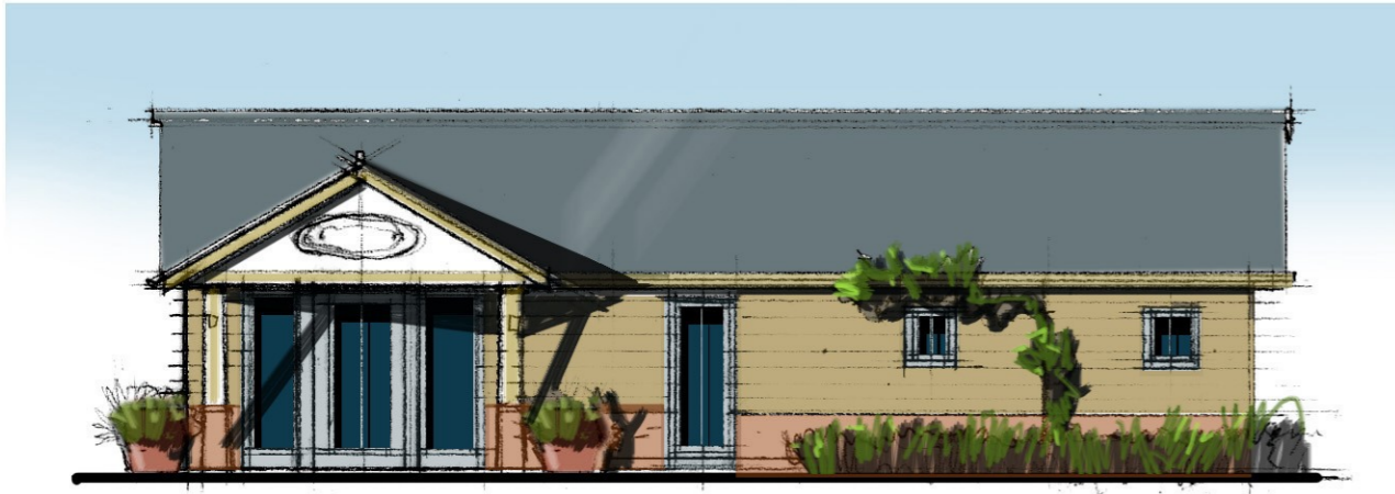
proposed front elevation 1:100