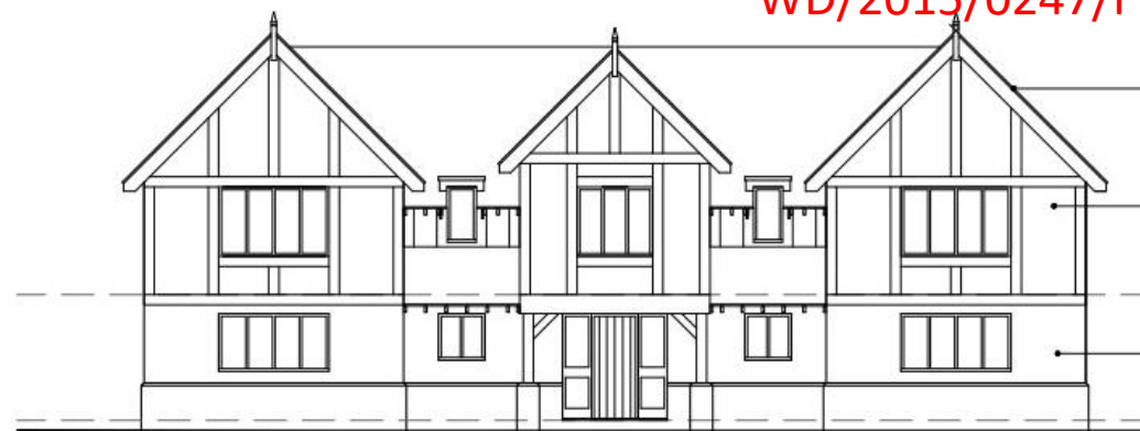
Front ( North ) Elevation A