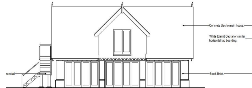
Front ( East ) Elevation W