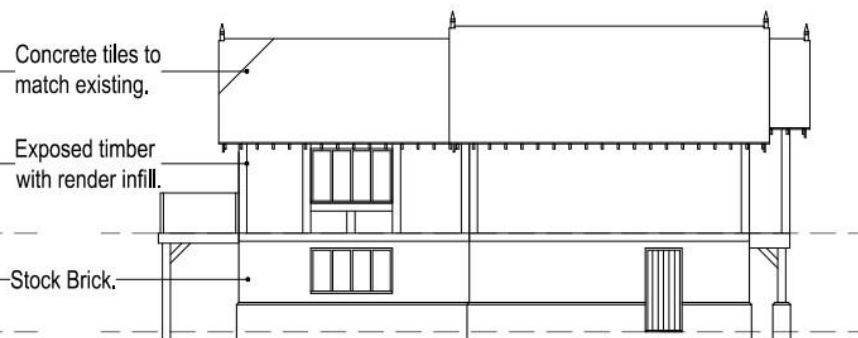
Side (West) Elevation B