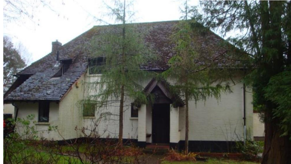
Existing North Elevation Archive photo 2015

* We understand from our clients that they have submitted a "Section 73 application to vary the Conditions showing the house as it now is, ie substantially removed and built back on new/existing foundations. This will mean the house is a new build rather than extension and alteration."