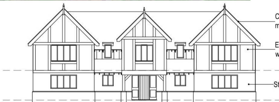
Front (North) Elevation A