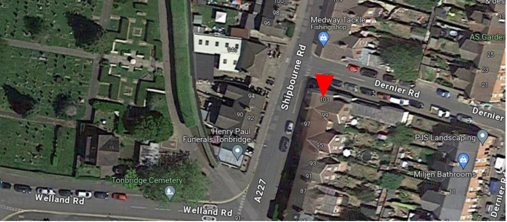
All photographs, graphics and plans are for illustrative purposes only