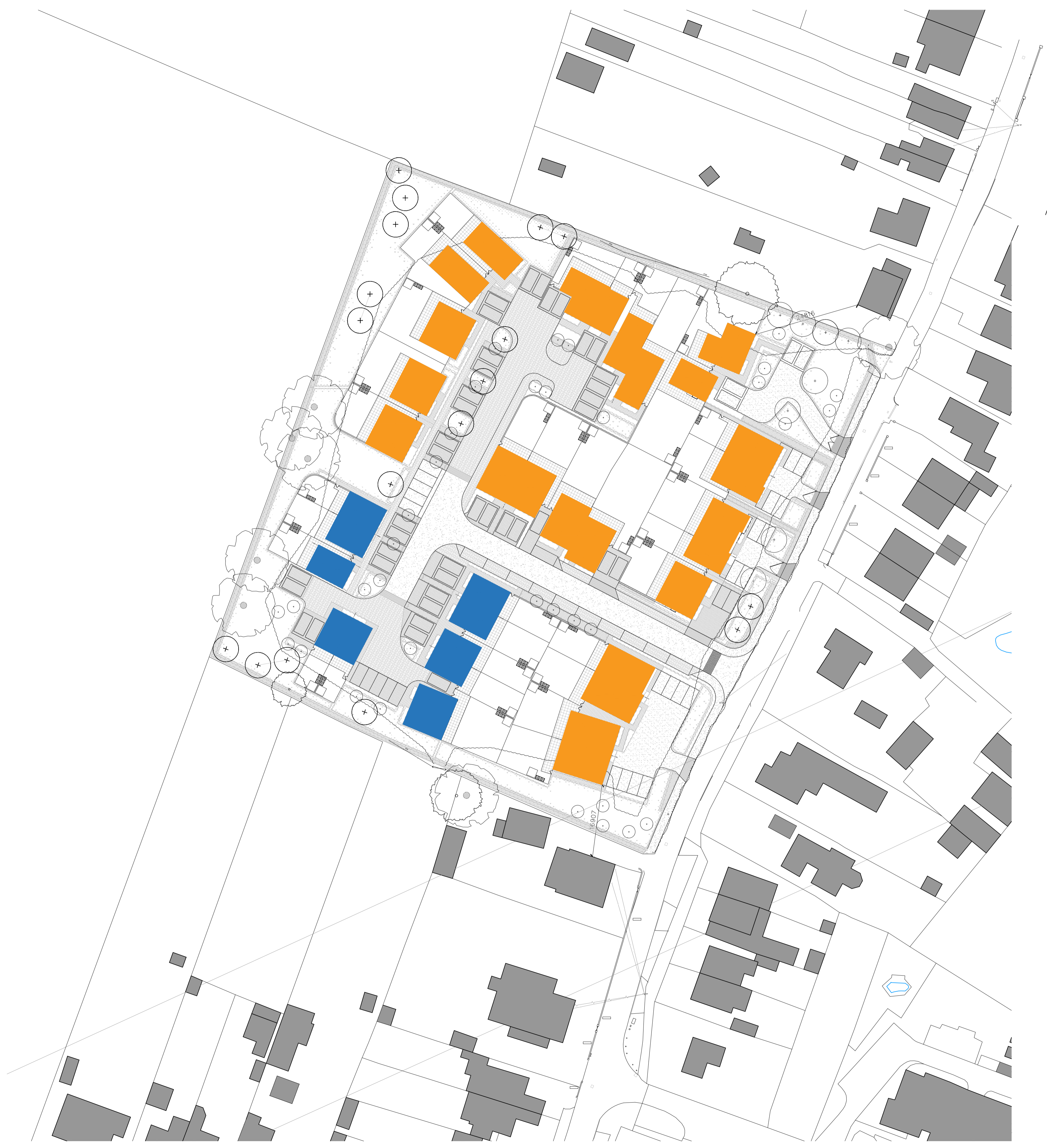
TENURE STORAGE PLAN