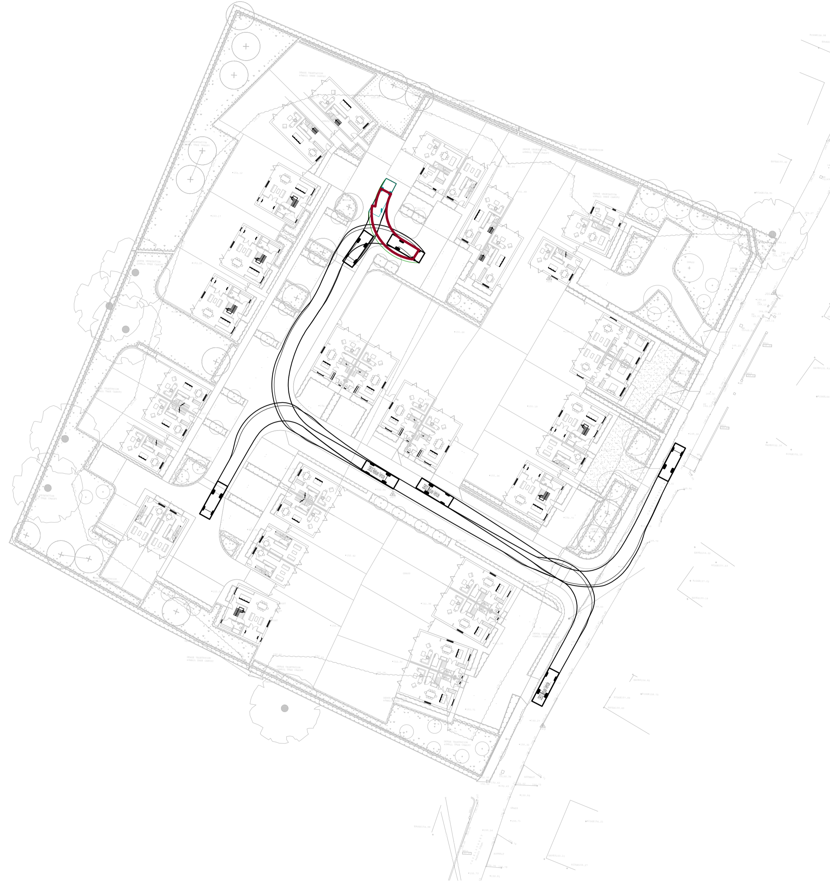
VEHICLE TRACKING - PRIVATE CAR SCALE 1:500 @ A1