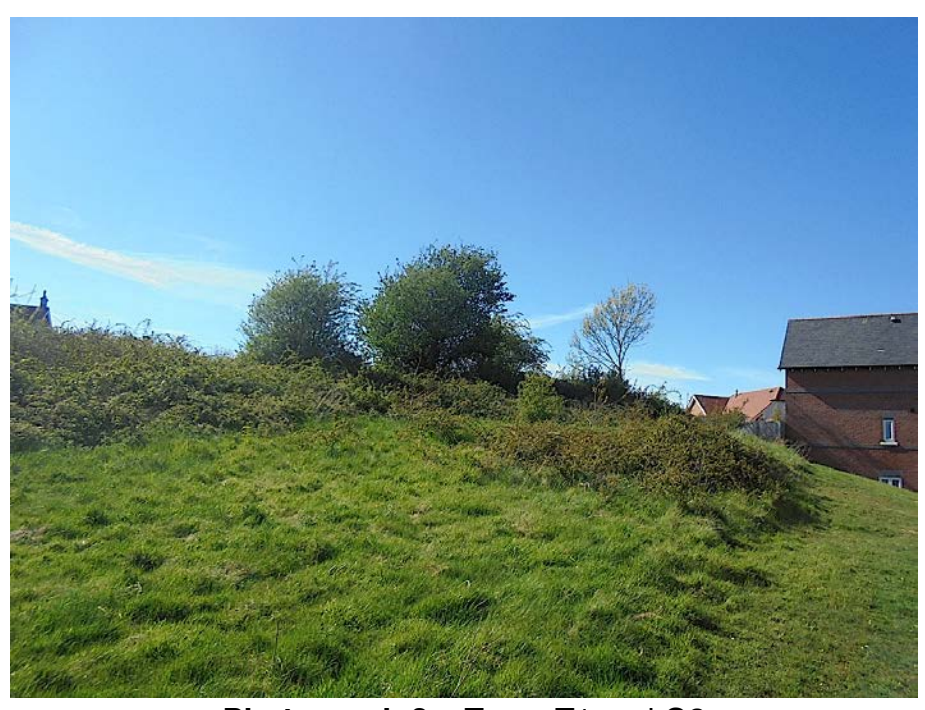
Photograph 2 - Trees T1 and G2