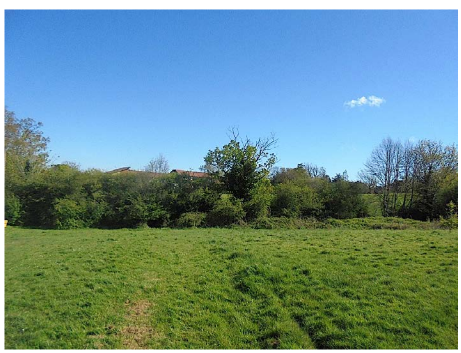
Photograph 3 – Trees H3-T7