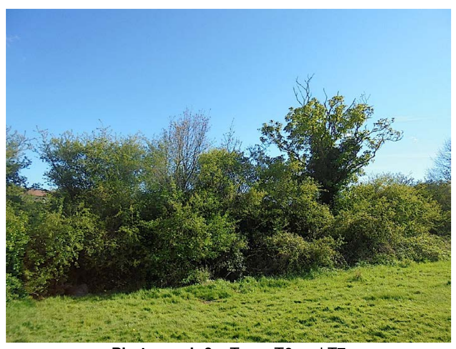
Photograph 6 - Trees T6 and T7