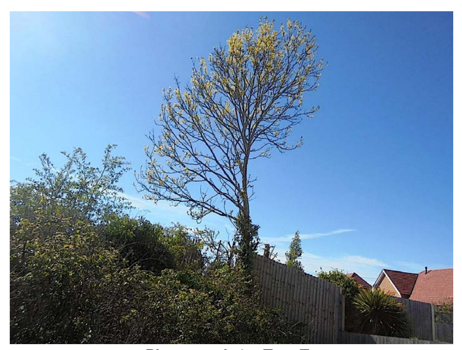
Photograph 1 - Tree T1