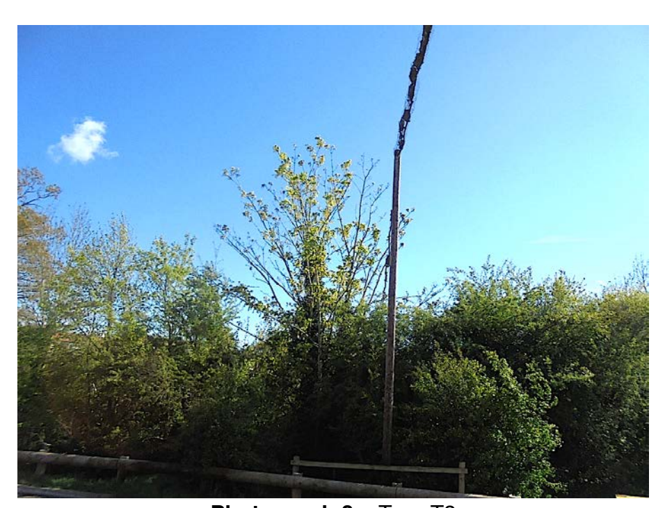
Photograph 8 – Tree T8