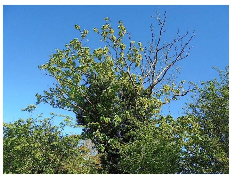
Photograph 5 – Tree T6