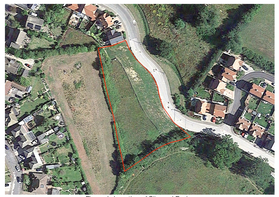
Figure 1: Location of Site and Environs

3.1 Site location: The site is situated on the south side of Reef Way, more broadly to the northeast of Hailsham Town Centre. It has a central OS national grid reference of TQ590100. The surrounding land use is comprised of residential properties on Reef Way to the north-west and east, and grass fields to the south and west. An unmanaged nature area is located on the opposite side of Reef Way to the north-east. The location of the site within its environs is shown in figure 1.