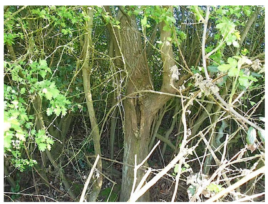
Photograph 7 – Tree T7