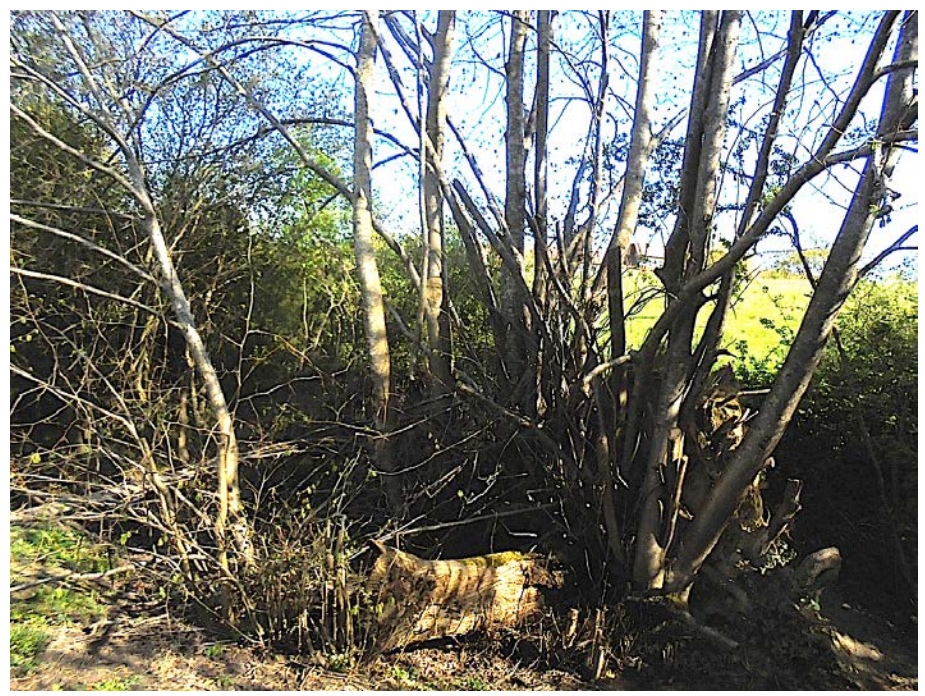
Photograph 4 – Tree T5